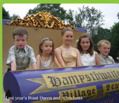
Last year's Feast Queen and Attendants

102 Hammerain House, Hookstone Avenue, Harrogate. Tel 01423 873552 Fax 01423 810330